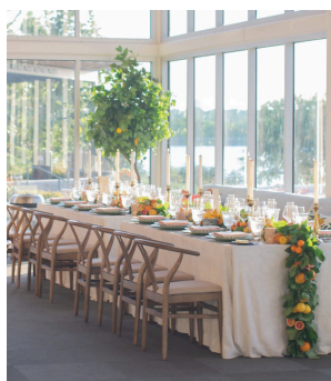
A TASTEFUL PLACE