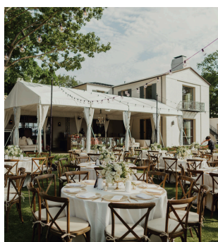
ALEX CAMP HOUSE